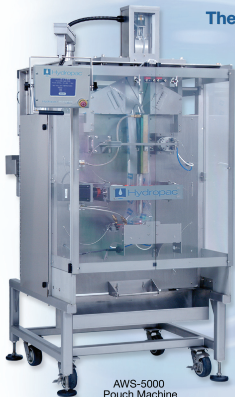
AWS-5000 Pouch Machine

Historically, automatic watering or water bottles have been the only viable options for rodent populations. Now the Hydropac™ Alternative Watering System delivers incredible savings in costs, space, inventory, labor, and energy usage.