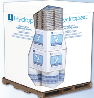
Master Carton for the AWS-5000 Pouch Machine

Hydropac™ Pouch and sterile Disposable Valve™ assemblies, shipped in a Master Carton for the AWS-5000 Pouch Machine provide materials for approximately 72,000 single-use pouch and valves (12 rolls of Hydroseal™ Pouch Film and 12 cartons of valves). For your convenience and ease of use, the sterile (gamma irradiated) Disposable Valve™ is packaged 100 per disposable plastic tray.